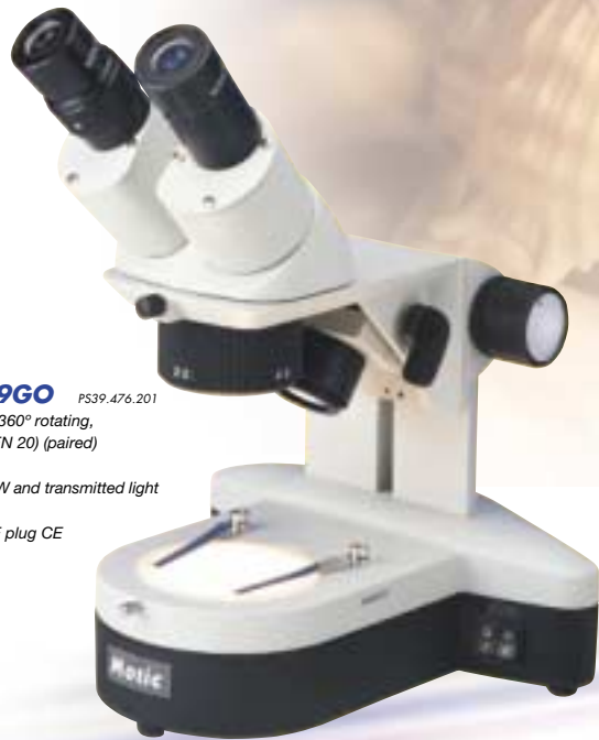
Model ST-39C-N9GO PS39.476.201 Binocular head 45° inclined, 360° rotating, Widefield eyepiece WF10x (FN 20) (paired) Objective : Turret type 2x, 4x Incident light halogen12V/10W and transmitted light tungsten 12V/10W Main supply 220V-240V, VDE plug CE

This series provides very good 3D image with high resolution image. Modern design which is the best tool for all applications.