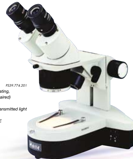
Model ST-39Z-N9GO PS39.774.201 Binocular head 45° inclined, 360° rotating, Widefield eyepiece WF10x (FN 20) (paired) Zoom objective : 1x-3x Incident light halogen12V/10W and transmitted light tungsten 12V/10W Main supply 220V-240V, VDE plug CE